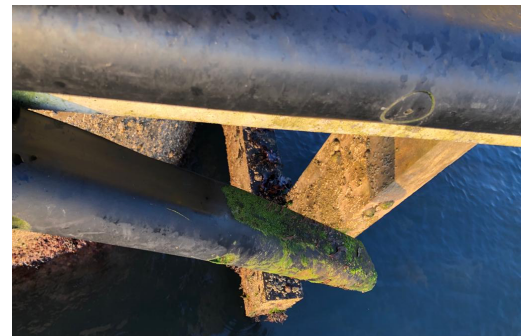
Figure 1: The rubber bumper at the end of the quay which had become detached.