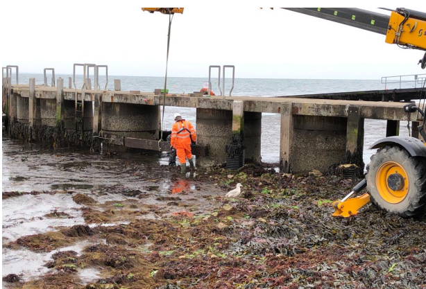
Figure 2: The timber fenders being replaced