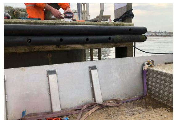
Figure 3: The repaired rubber bumper at the end of the quay